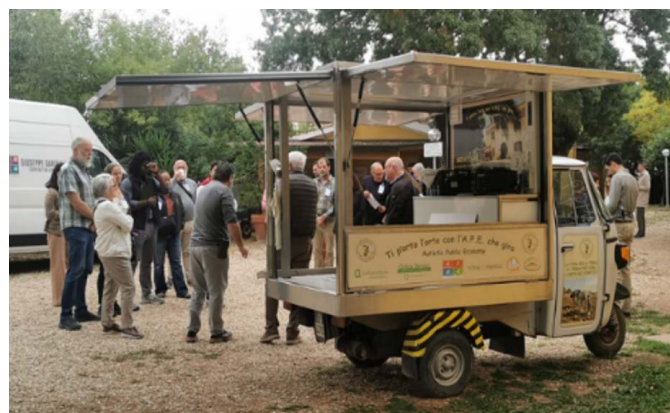
Delegates from the EU, US, and Canada visiting the Garibaldi Cooperative on October 17th, 2025.