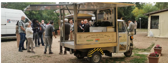
Delegates from the EU countries, United States and Canada visiting the Garibaldi Cooperative on October 17th, 2025.