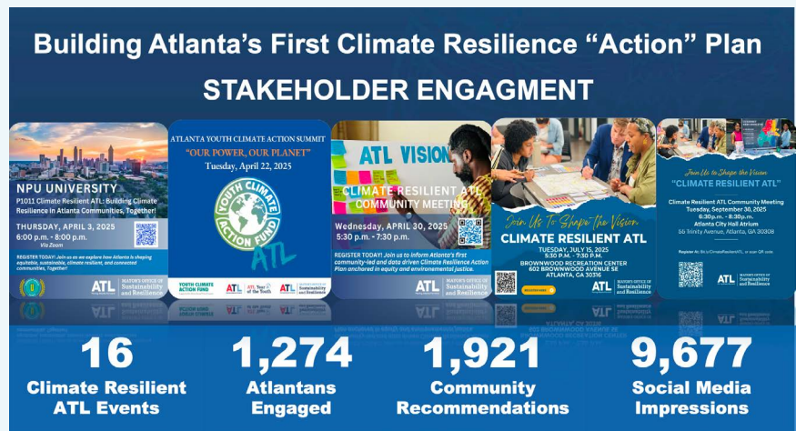
Figure 1: Presentation from Chandra Farley, Chief Sustainability Officer at the City of Atlanta, for the IURC NA webinar Financing Urban Forests: How Cities are Leveraging Carbon Credits for Greener Futures on November 20th, 2025.

The Climate Resilience Plan will broaden Atlanta's focus beyond clean energy, integrating additional critical objectives to better address the ways in which Atlanta is being affected by climate change. Atlanta's approach emphasizes "multi-solving"—the principle that effective climate and sustainability strategies must deliver multiple co-benefits. This means not only tackling the direct impacts of climate change but also generating positive outcomes for health, social equity, and community resilience.