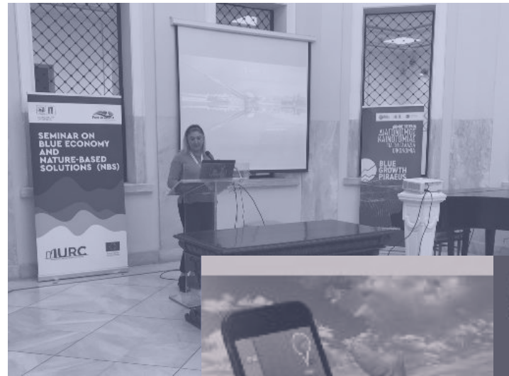
Presentation of Destination Piraeus in Piraeus