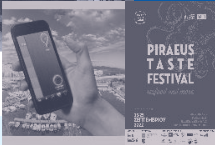
Tourist activities and apps

Activity: Exchange of local experiences and good practices on the promotion of local tourism.