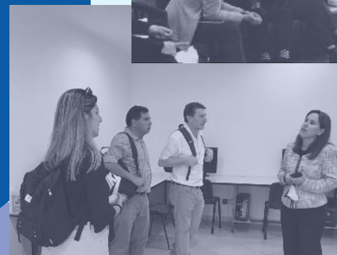
Visit to the offices of Startup Piraeus