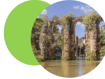
Western Greece Region

This Western Greece Region holds a leading position in advanced materials, nano-technology, microelectronics and bio-products and focuses on design, simulation, software and integrated circuits.