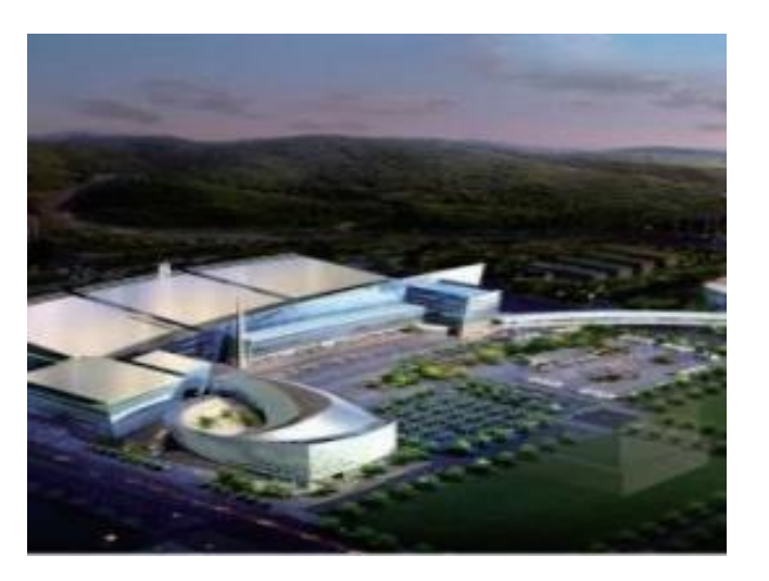
BEXCO Exhibition Center III