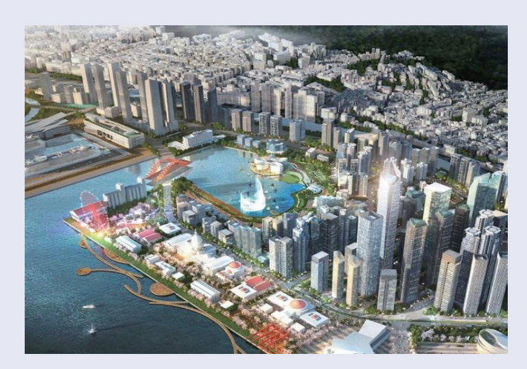
2030 Busan World Expo (North Port)

The city's natural endowments and rich history have resulted in Busan's increasing reputation as a world-class city for tourism and culture, and it is also becoming renowned as a hot spot destination for international conventions.