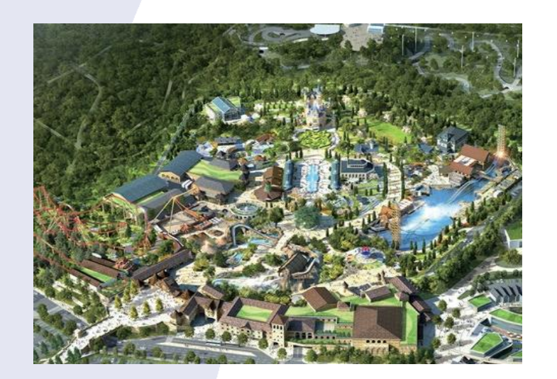
OSIRIA Tourism Complex