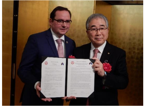
Mayors of Essen and Koriyama signed the MoU in Dec. 2017