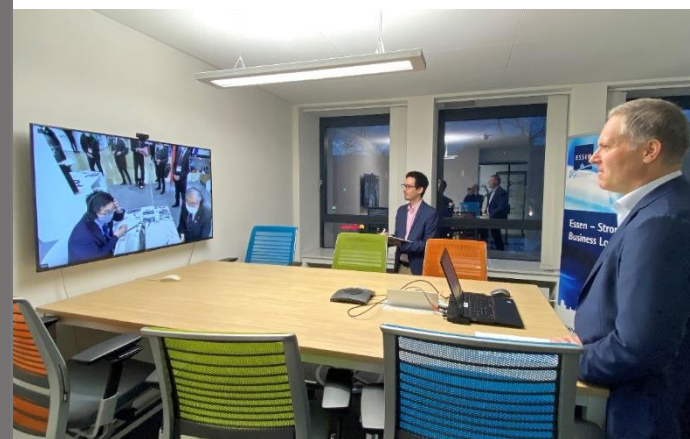
The virtual booth of Essen at REIF Fukushima in Oct. 2020, which was ran by a Koriyama city government officer for the first time due to the enduring pandemic of the coronavirus.

情報交換、スタディツアー、共同セミナー、共同研究など様々な活動を行ってきました。中でも特徴的なのは、産業界を巻き込んだビジネス・マッチング・イベントや見本市の開催への共同参加です。エッセンでは欧州最大のエネルギー見本市「E-world energy & water」が、郡山市では「REIFふくしま」が毎年開催されています。コロナ禍により物理的な移動が制限されるなか、エッセンは2020年には、オンラインでREIFふくしまに参加しました。