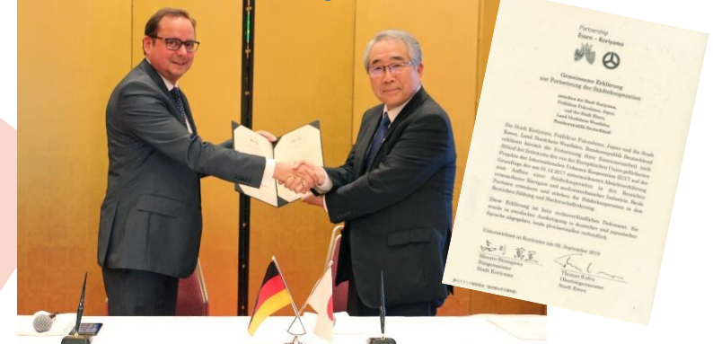
Essen & Koriyama concluded the agreement on the continued cooperation in Sep. 2019