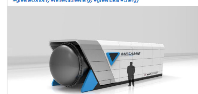
the Gas- und Wärme-Institut Essen e.V.(GWI) implemented the first SOFC from Mitsubishi Power Europe