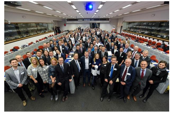
Essen & Koriyama were part of the city-to-city meetings in Brussels in Nov. 2018