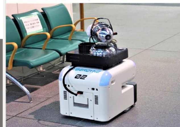
'Utilizing ready-to-assemble & quick deploy ER made of honeycomb cardboard panels as care units for patients of COVID-19' and 'Autonomous Cleaning and Disinfection Robot' were presented.