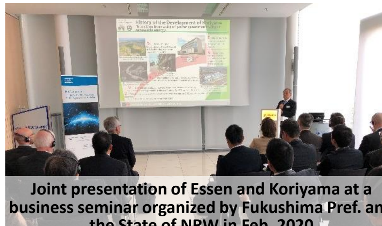
Joint presentation of Essen and Koriyama at a business seminar organized by Fukushima Pref. and the State of NRW in Feb. 2020

情報交換、スタディツアー、共同セミナー、共同研究など様々な活動を行ってきました。中でも特徴的なのは、産業界を巻き込んだビジネス・マッチング・イベントや見本市の開催への共同参加です。エッセンでは欧州最大のエネルギー見本市「E-world energy & water」が、郡山市では「REIFふくしま」が毎年開催されています。コロナ禍により物理的な移動が制限されるなか、エッセンは2020年には、オンラインでREIFふくしまに参加しました。