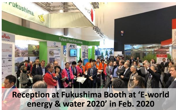
Reception at Fukushima Booth at 'E-world energy & water 2020' in Feb. 2020