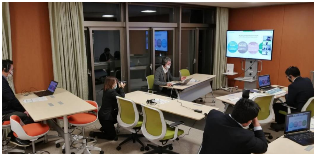
The first online business matching event was held in Feb. 2021, three SMEs in Koriyama area gave pitches to medical institutions in Essen

オンラインでのビジネス・マッチング・イベントも開催されました。写真は、郡山市の中小企業がエッセンの医療機関に革新的な技術を紹介する様子です。都市間連携が、それぞれの都市の産業競争力を強化し、新しいビジネスを生み出す仕組みのひとつとなっています。